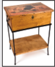
End Table Box with Shelf and Puppies Print Item #W0821341