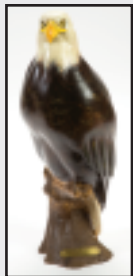
"Freedom's Apostle" Carved Wood Eagle Item #W0810272