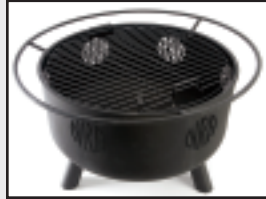
Custom NRA Firepit and Grill Item #M0821291