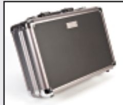
NRA Double Pistol Case Item #M0820871