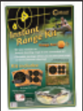
Instant Range Kit Item #M0821332