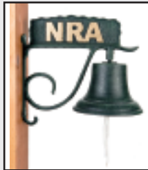
NRA Dinner Bell Item #M0821011