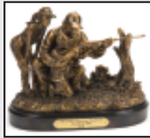
"The Lesson" Shooting Traditions 2008 Item #S0820272