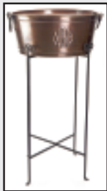
NRA Copper Tub Item #M0811391