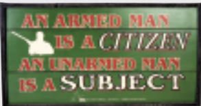
"An Armed Man" Wood Sign Item #M0810272