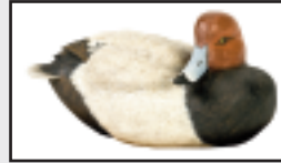
Red Head Decoy Item #M0810271