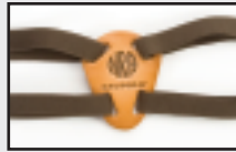
Leupold Quick Release Binocular Harness Item #M0820082